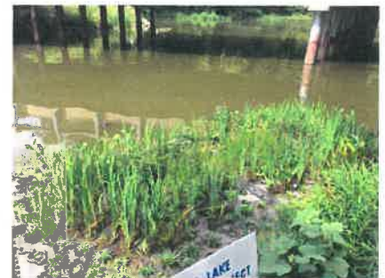
Moundwood FTW in full bloom! (Bonus snake in bottom left)

In 2019 both wetlands will be back in the lake. The smaller of the two wetlands will be filled with one species of wetland plant. Testing will be done throughout the spring/summer to determine how the plants absorb the nutrients. So keep your eye out for the Floating Treatment Wetlands in 2019!